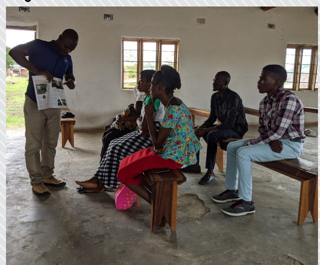
Students undergoing Mentorship Program