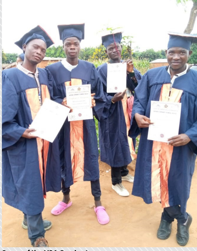
Some of the VSA Graduates