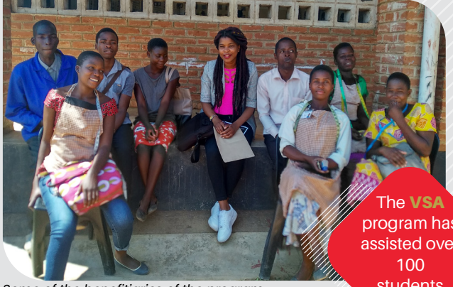
Some of the benefitiaries of the program

Seeking and providing employment and internship opprtunities for young people upon completion.