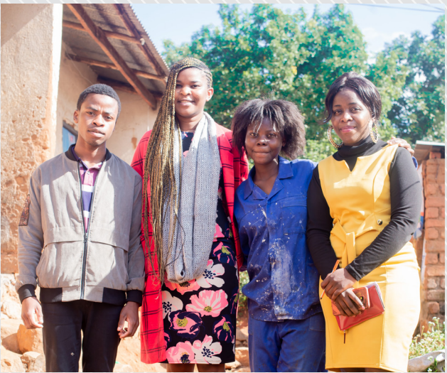
Program team with some of the students