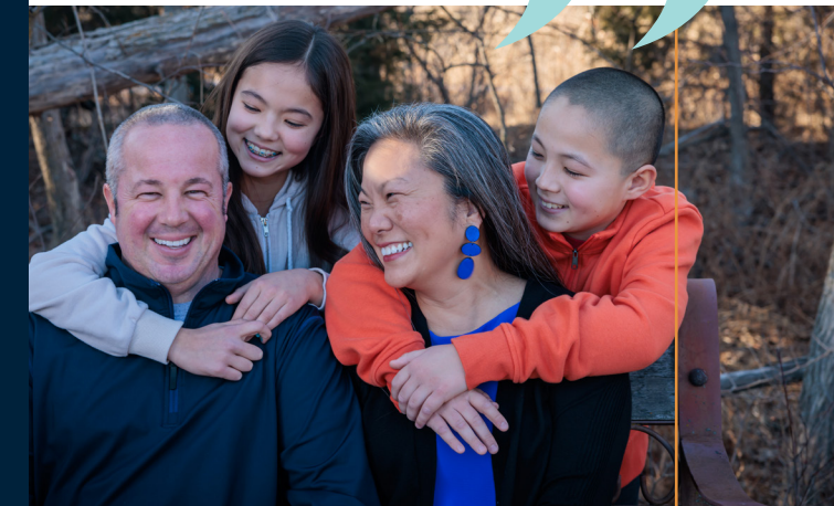
The Nash Family

our buildings to grow as our church grows.