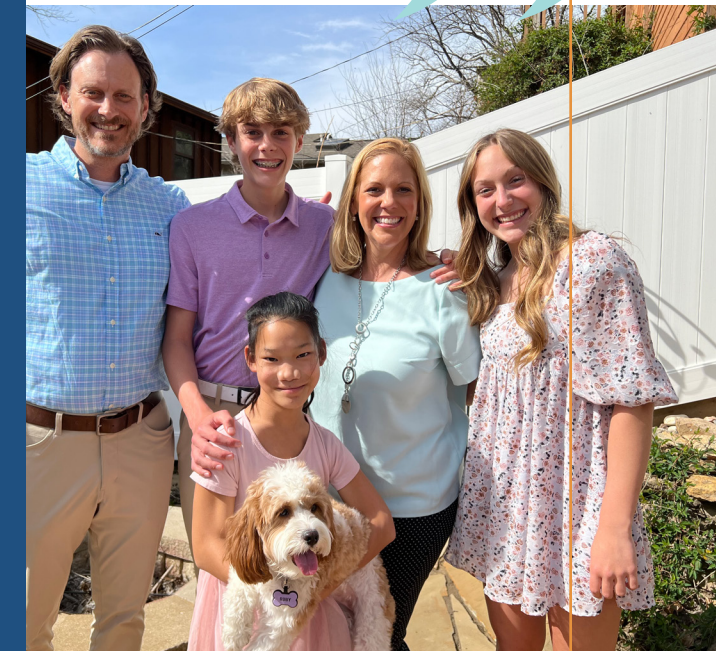
The Beveridge Family