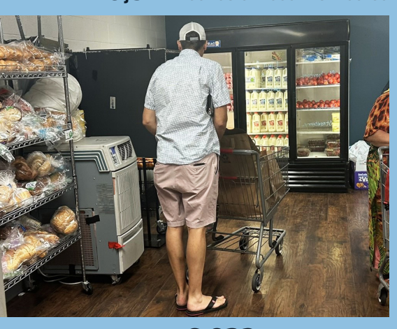
• 6,823 Families Served