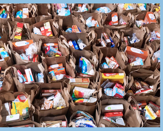
○ 600 Holiday Meal Bags