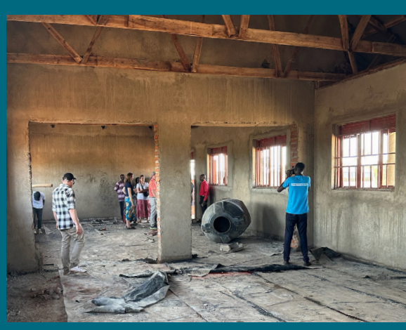
UGANDA: NAKALAMA SCHOOL, NEW CLASSROOMS