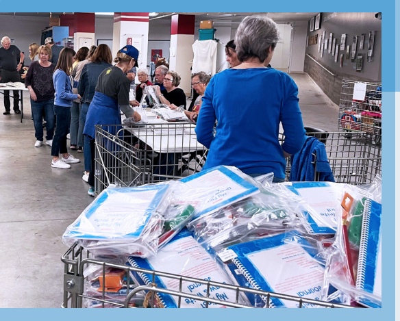
• 53,344 Weekend Food Backpacks