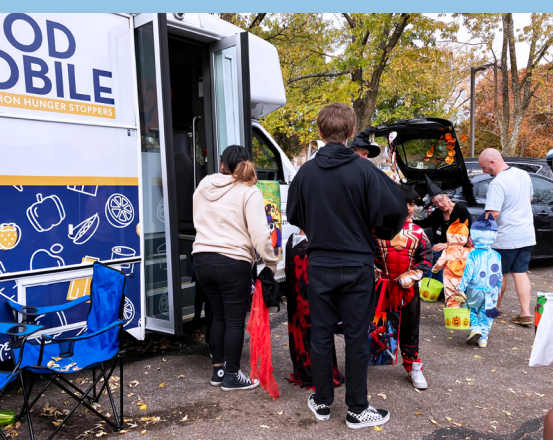
• 446,317 Pounds of Food Distributed